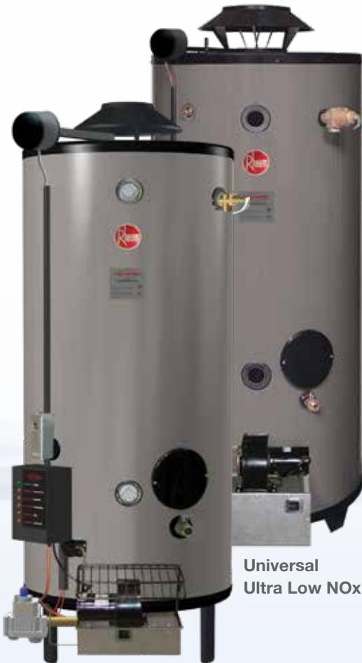
Universal Low NOx