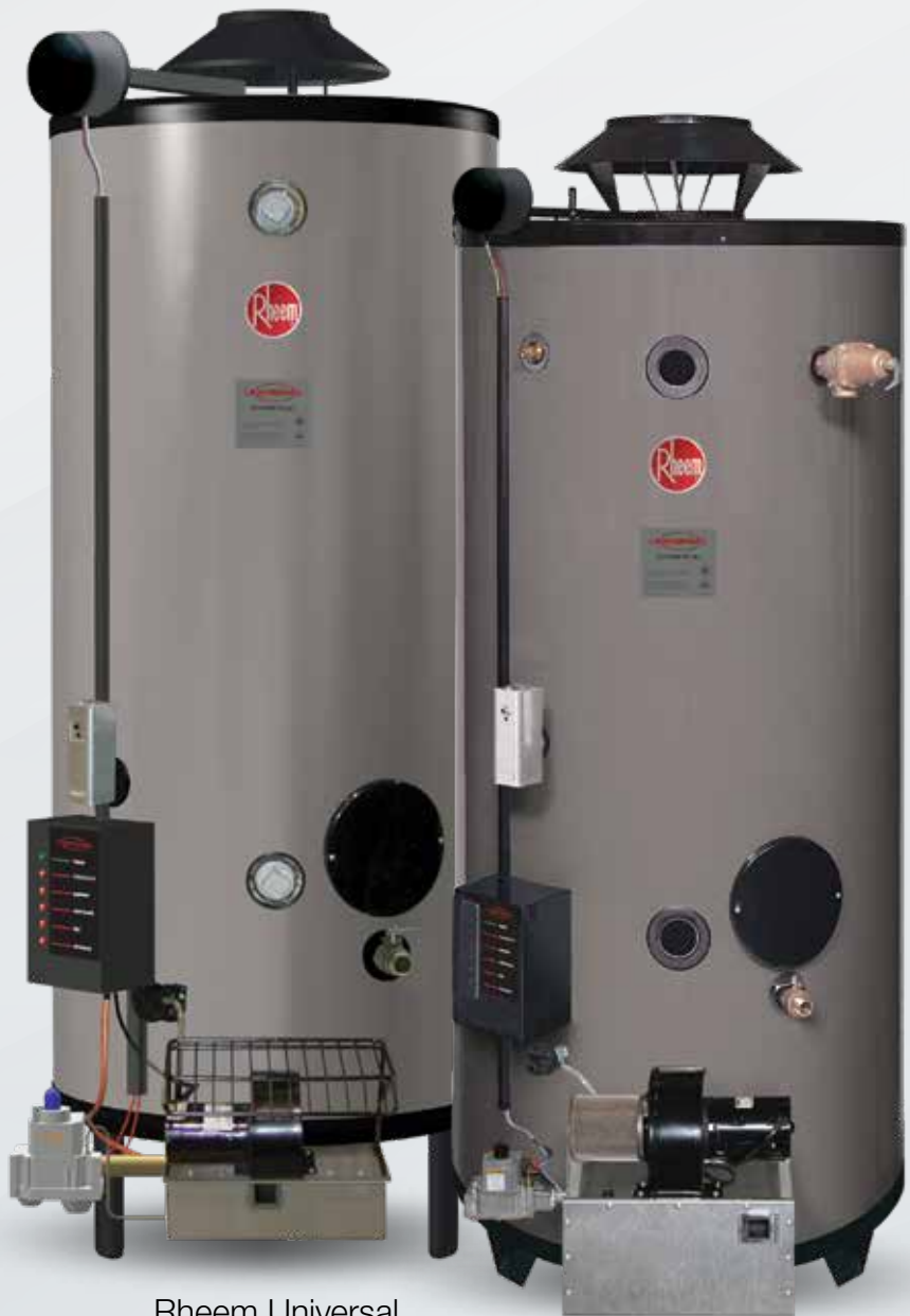
Rheem Universal Low NO x

Compact Size Commercial Gas Water Heaters for Heavy Duty Applications