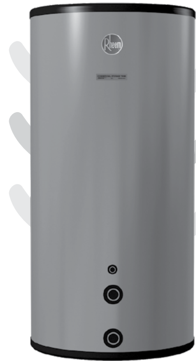
Rheem Commercial Storage Tanks 80, 115 and 175-Gallon Capacities